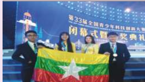
Figure.5. Activities of YTU at CASTIC in 2018

The outcomes after two months internship (fully funded) at Sirindhorn International Institute of Technology in Thailand of two students from YTU had been published in IEEE.