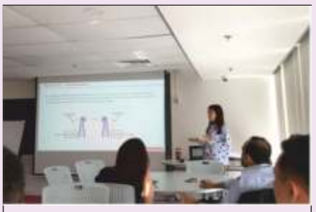
Figure.4 Seminar after Internship at OOREDOO (Telecommunication Industry)